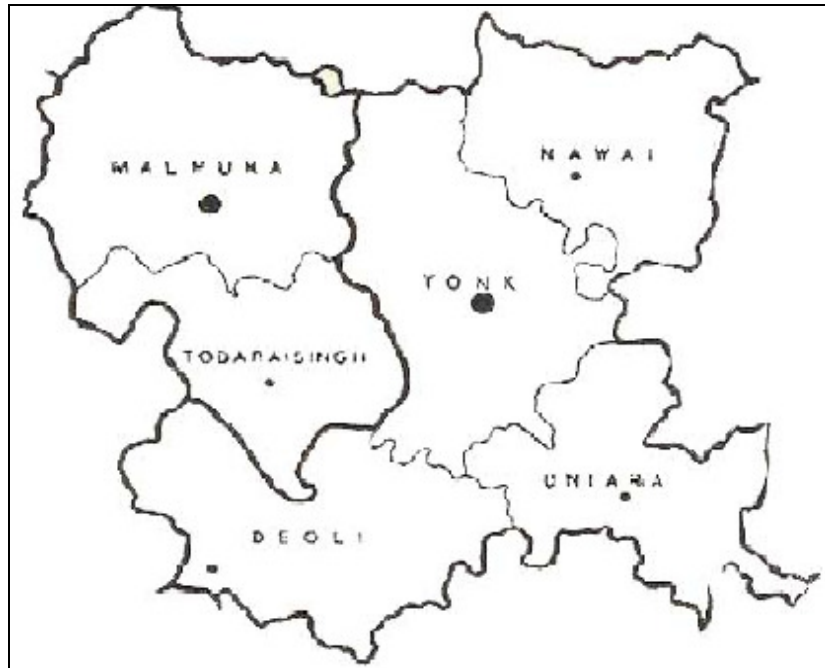
Fig.-1: Study Area- Tonk District (Rajasthan)